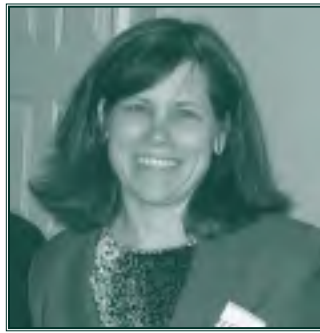
KERRY KRIEGER TREATMENT FOSTER CARE Staff Excellence Award